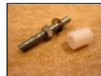
Fixings for note 3.