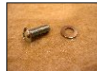
Fixings for note 2.