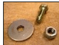
Fixings for note 1.