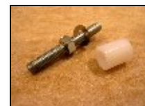
Fixings for note 3.

Any queries please contact our technical department: (01438) 747202.