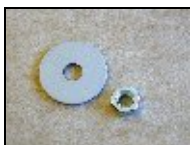
Fixings for note 1.